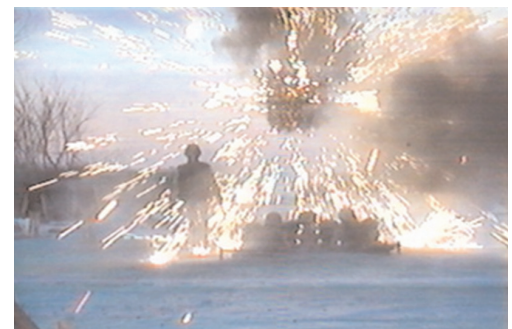
LW25mm Airburst Round